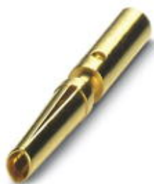
Crimp contact, turned, Contact diameter: 0.8 mm, Crimp range: 0.08 mm²...0.25 mm²

Please be informed that the data shown in this PDF Document is generated from our Online Catalog. Please find the complete data in the user's documentation. Our General Terms of Use for Downloads are valid ( http://phoenixcontact.com/download )